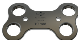
PEDUS-U Locking Universal Plate