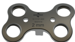
PEDUS-O WS Open Wedge Plate